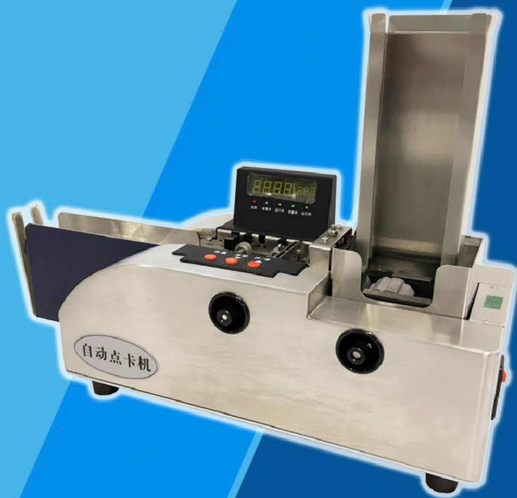
Automatic Card Counting Machine T-C10T