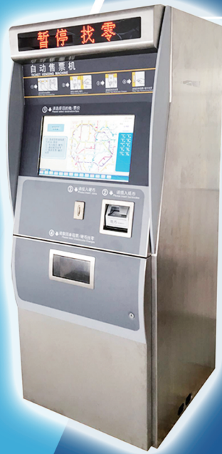
Automatic Ticket Vending Machine V-C100S